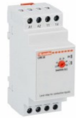
Level control relay for emptying function. Single voltage. Modular version LVM20 Emptying